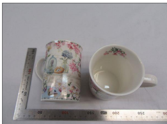
Sample No. 9,10