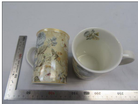
Sample No. 3,4