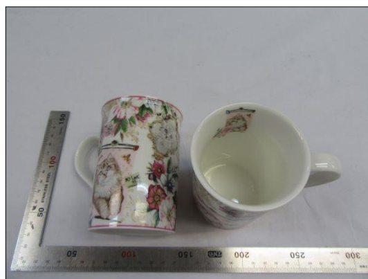
Sample No. 11,12