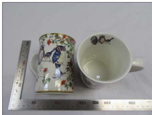
Sample No. 7,8