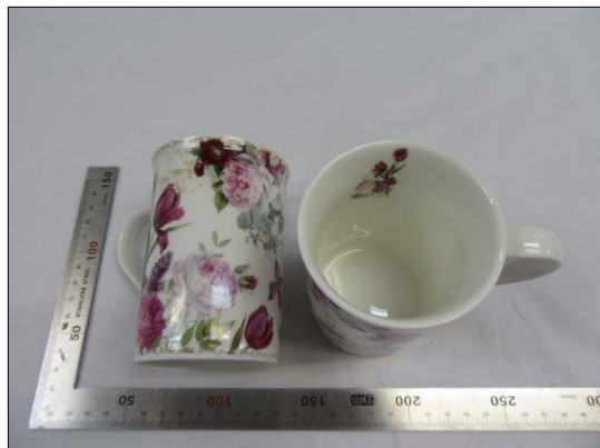
Sample No. 1,2