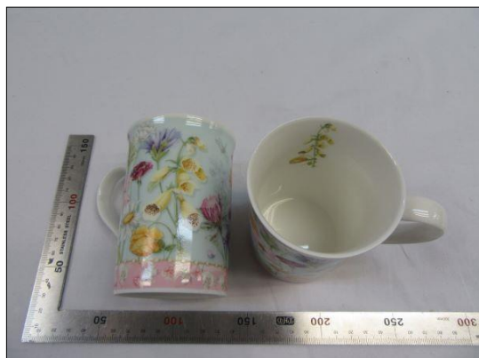
Sample No. 5,6