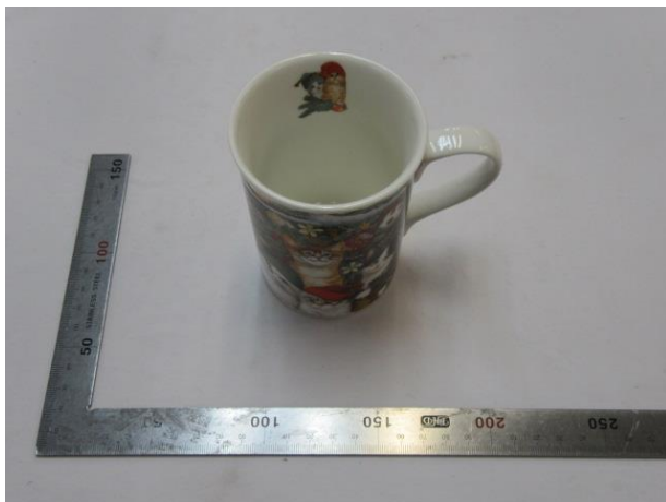
Sample No.1A & 1B